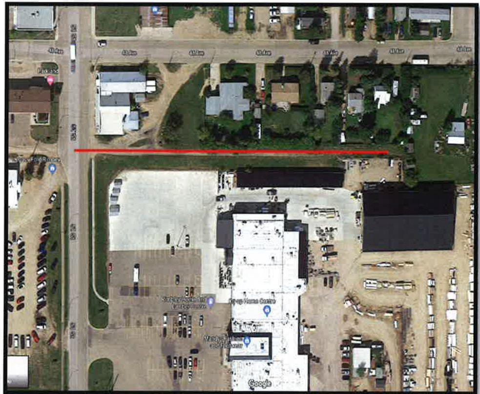
— Approximate alley location

Background The Town of Rimbey has received a request to close a portion of the alley behind Lot 3 Block 13 Plan 8320606 east of 51 Street and south of 48 Avenue. On December 28, 2018 Administration sent a letter to all potentially impacted landowners to gauge their interest in closing the alley and purchasing the lands located adjacent to their property. The properties contacted were Lots 12, 13, Block 3, Plan 832 0606; Lot 14 & 15, Block 3, Plan 892 0100; Lot 10, Plan 792 2928; Lot 3, Plan 8325ET. The proposed alley closure is depicted on the following image: