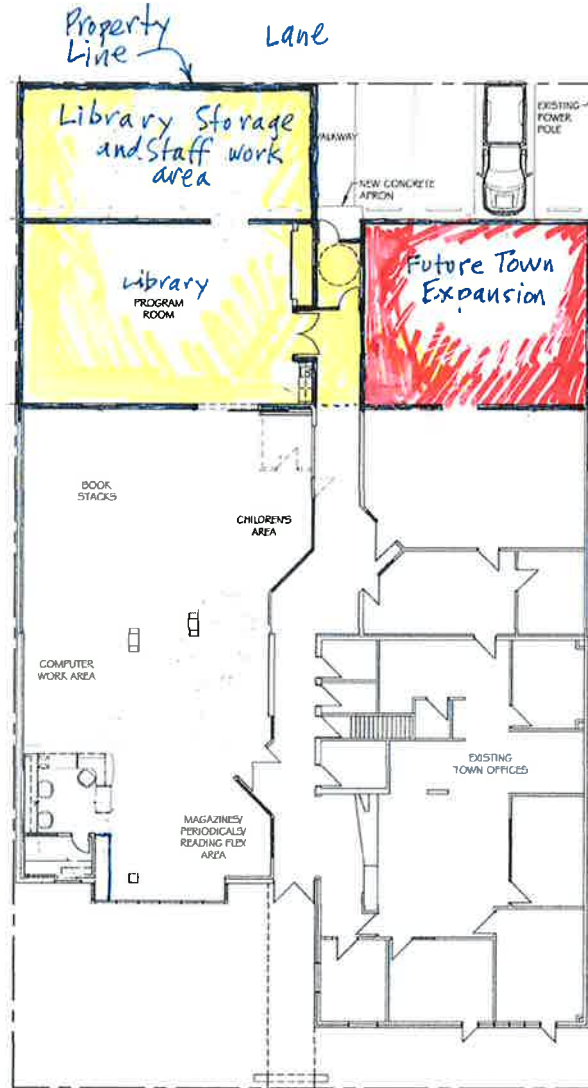
Proposed Library Expansion Concept May 5, 2020