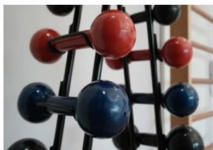
Peter Lougheed Community Centre – Upper Auditorium