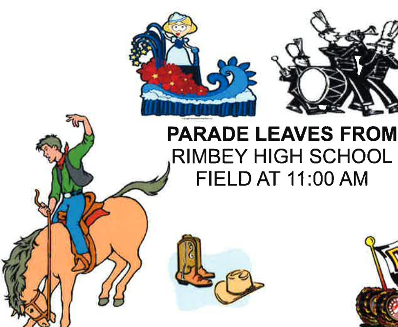
RIMBEY RODEO - FRIDAY, SATURDAY and SUNDAY