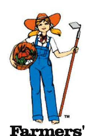
Market SERVUS CREDIT UNION PARKING LOT 9:30 - 12:00